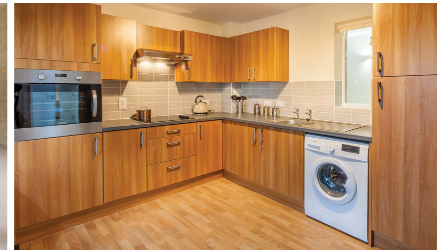
Photos: Example ShireLiving apartments